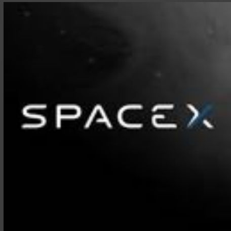
Gwynne Shotwell President & COO